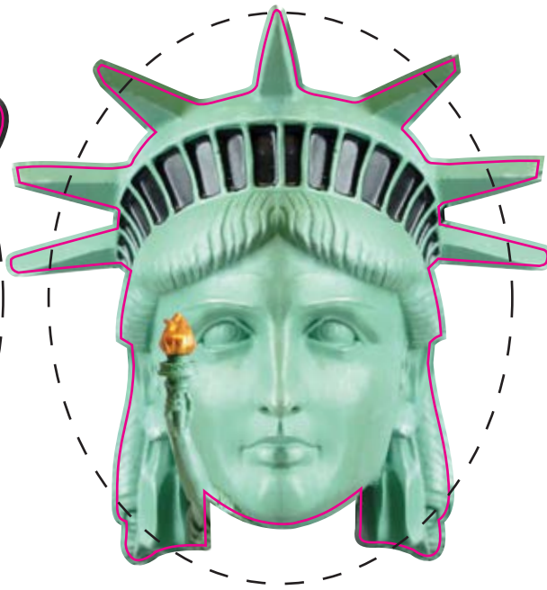
* 3.1" X 3.2"