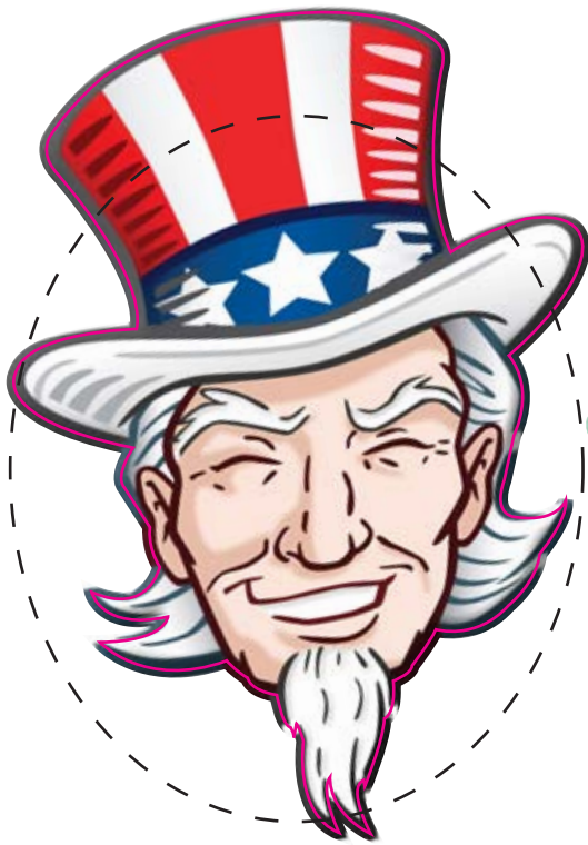
* 2.6" X 3.8"

Depending on the shape, head height and width may vary.* Use the head measurement samples below as a general guide.