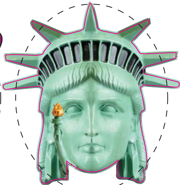
* 3.1" X 3.2"